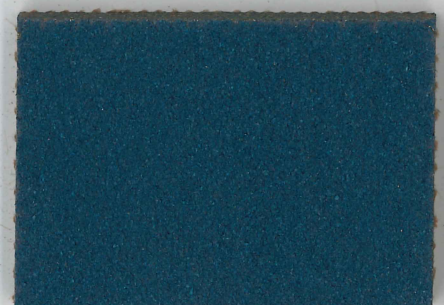
2214 | blue berry NCS 6030 - B LRV 6%