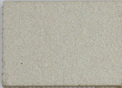
2206 | oyster shell NCS 3502 - Y LRV 43%