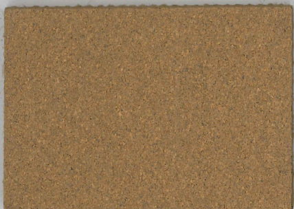
2166 | nutmeg spice * NCS 4030 - Y30R LRV 22%