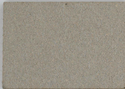
2182 | potato skin * NCS 4005 - Y20R LRV 28%