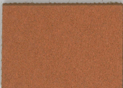
2207 | cinnamon bark NCS 4040 - Y50R LRV 18%