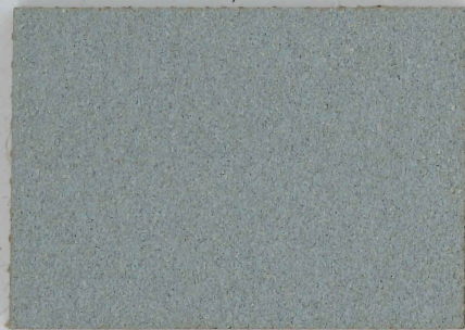
2162 | duck egg NCS 5005 - B80G LRV 25%