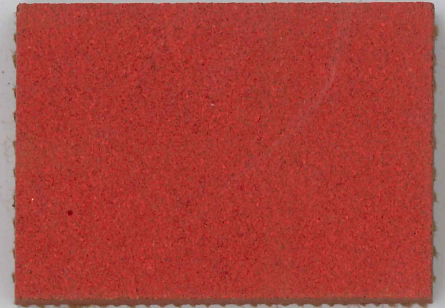
2210 | hot salsa NCS 3560 - Y90R LRV 11%