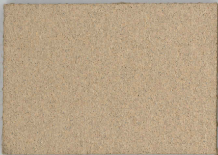
2186 | blanched almond * NCS 3020 - Y20R LRV 34%