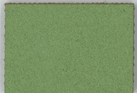
2213 | baby lettuce NCS 4030 - G30Y LRV 23%