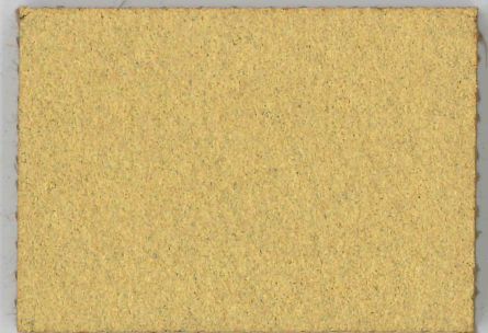
2212 | fresh pineapple NCS 3030 - G90Y LRV 40%