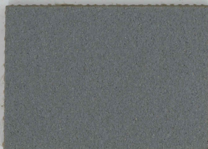
2204 | poppy seed NCS 6500 - N LRV 16%