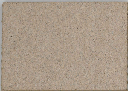
2187 | brown rice NCS 4010 - Y30R LRV 34%