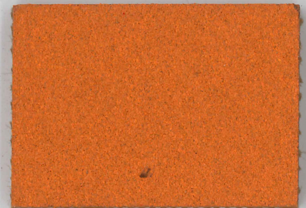
2211 | tangerine zest NCS 2070 - Y60R LRV 20%