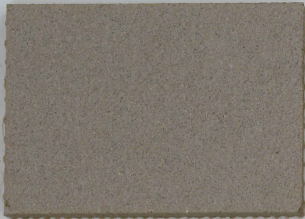
2208 | mushroom medley NCS 5005 - Y50R LRV 21%